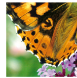
Process Colour (CMYK)

Cyan, Magenta, Yellow, Black. Primary colors of pigment which we use to print your artwork