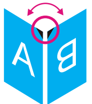
Landscape & Portrait