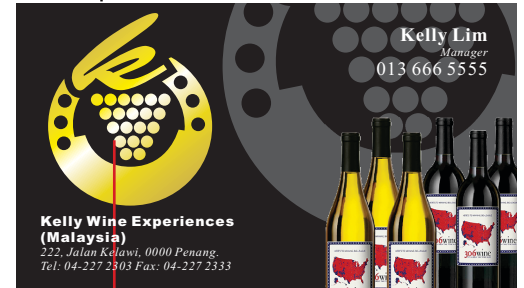
Gold Hot Stamping

DONOT delete the 'Full Bleed' box; change the line colour to 'WHITE'